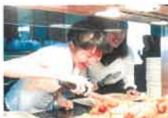
Eating in The Dome