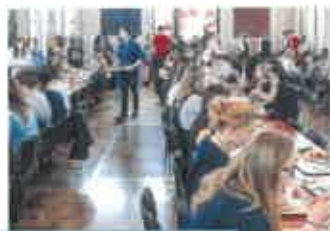
Booking Events in College